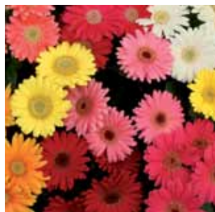
Mini Revolution Mixture is a uniform mix of bold and pastel colors.