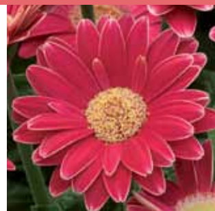
Mini Revolution Rose