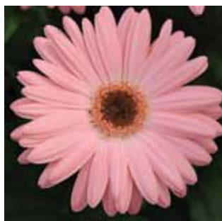
Light Salmon with Dark Eye