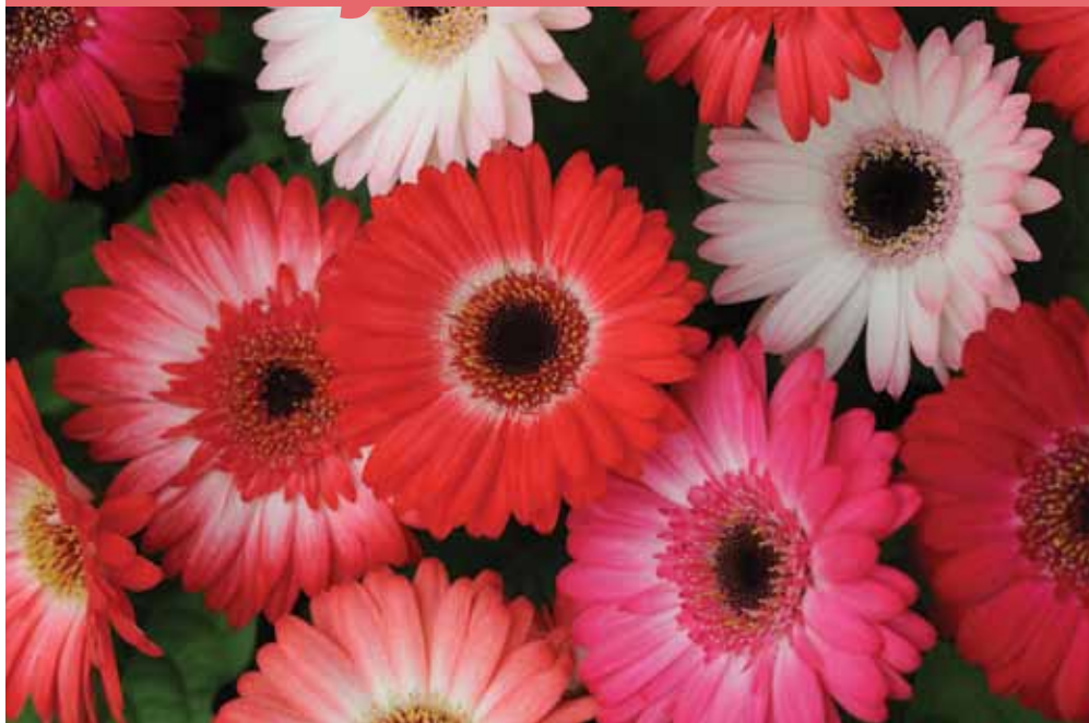
New Midi Revolution Strawberry Shortcake