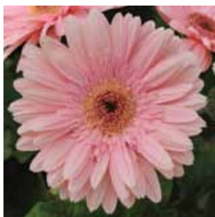
Pastel Pink Shades with Dark Eye