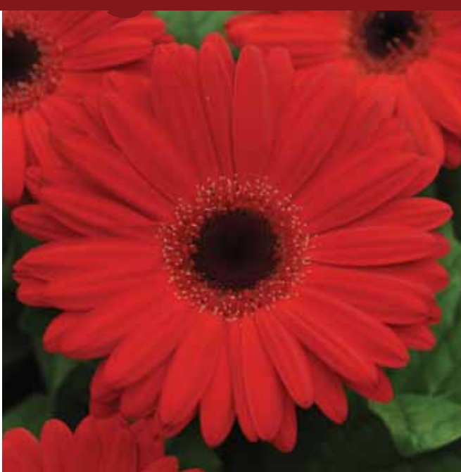
New Red with Dark Eye