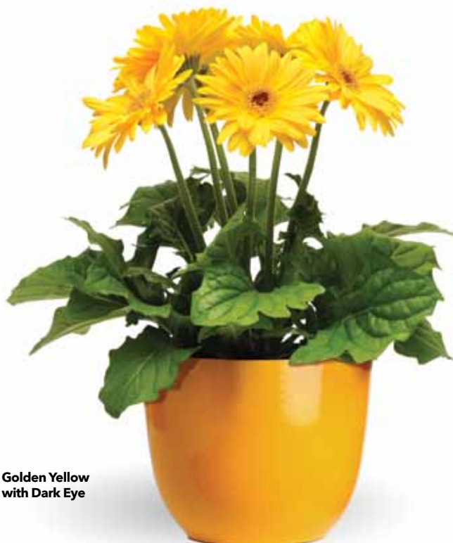
Golden Yellow with Dark Eye