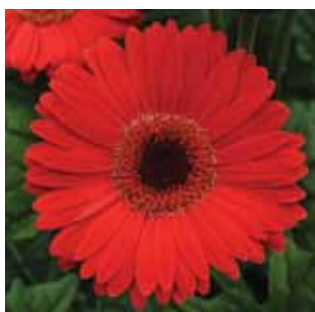
New Bright Red with Dark Eye