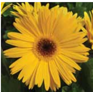
Golden Yellow with Dark Eye