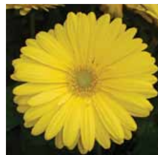
Yellow with Light Eye