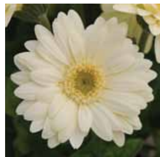
Mini Revolution White