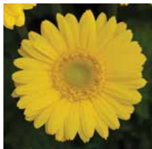
Mini Revolution Yellow