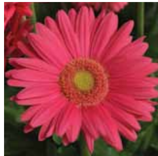
Rose with Light Eye