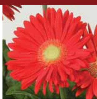
New Bright Red with Light Eye