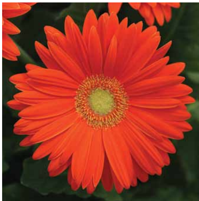
New Orange with Light Eye