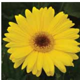
Yellow with Dark Eye