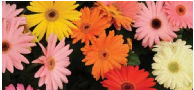
Classic Mixture has a broad range of bright and pastel colors.