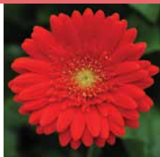
Mini Revolution Red with Light Eye