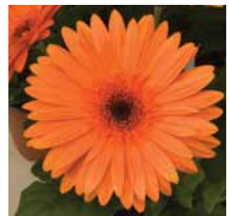
Orange with Dark Eye