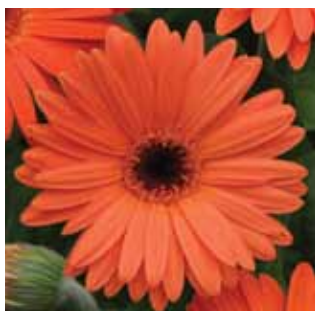
Pastel Orange with Dark Eye