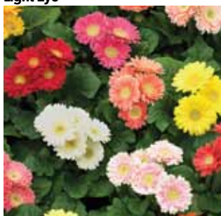
Micro Revolution Irish Eyes Mixture