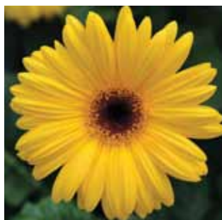
Golden Yellow with Dark Eye