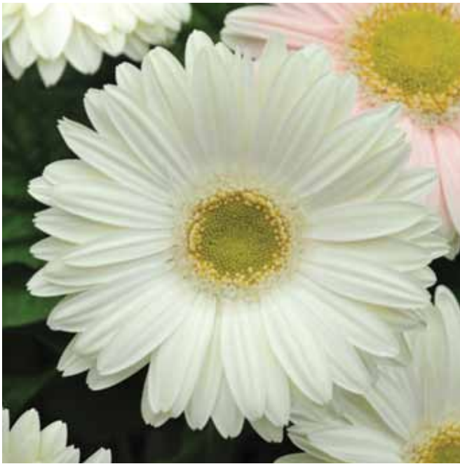
New White with Light Eye