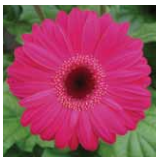
Neon Rose with Dark Eye