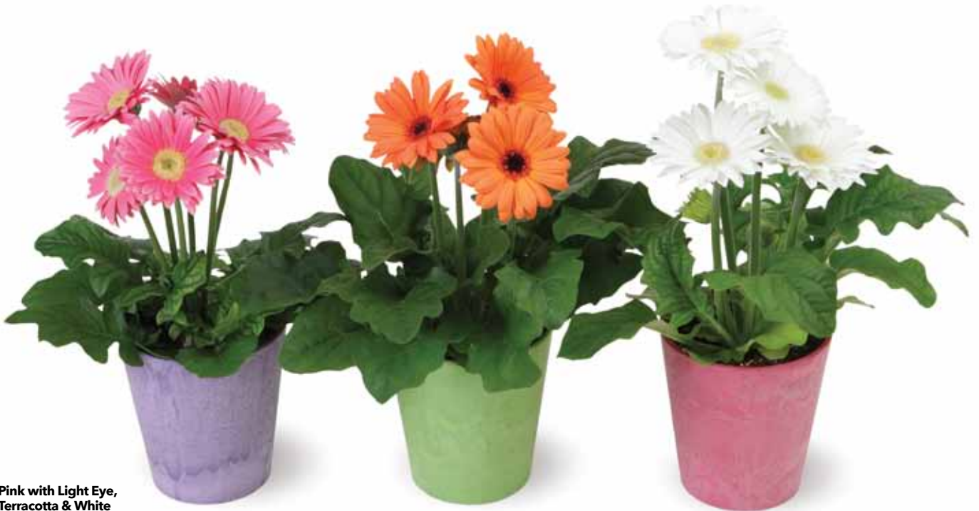
Pink with Light Eye, Terracotta & White with Light Eye