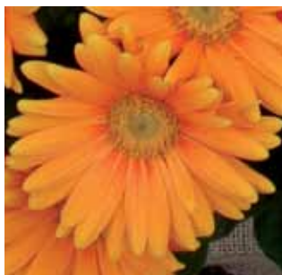
Mini Revolution Orange with Light Eye