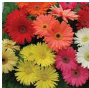
Classic Mixture is a broad range of bright and pastel colors.