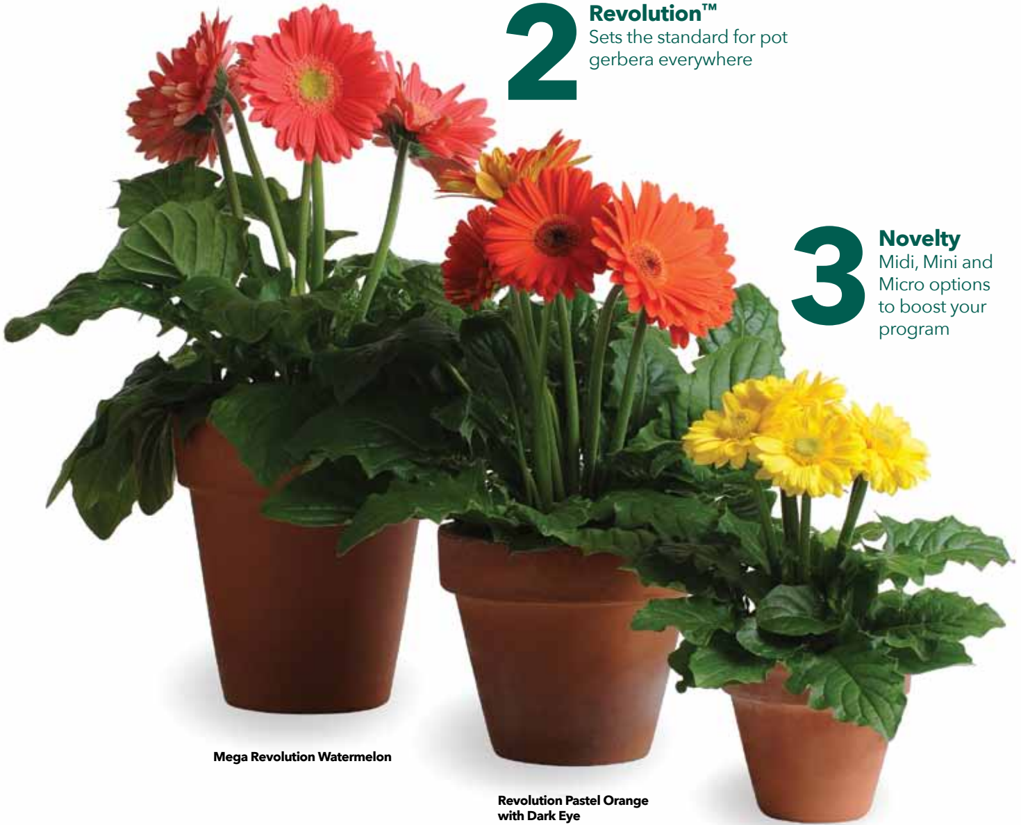
Mega Revolution Watermelon

Midi, Mini and Micro options to boost your program