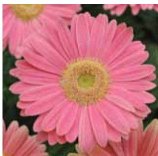
Pink with Light Eye