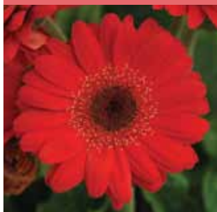
Mini Revolution Red with Dark Eye