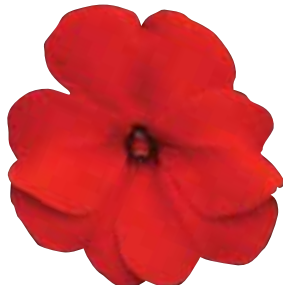
Orange Bronze Leaf