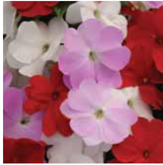
NEW Islander Mixture