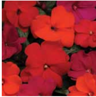
NEW Hot Cha Cha Mixture