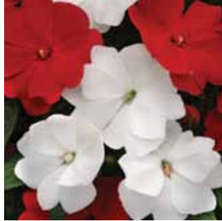
Red White Mixture