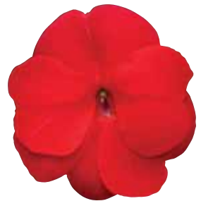
Scarlet Bronze Leaf