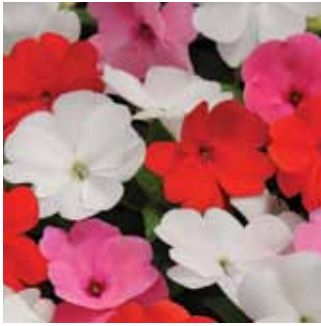
NEW Fresh Mixture