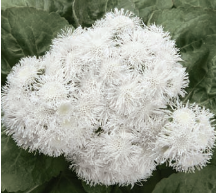
High Tide™White Ageratum