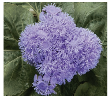
High Tide™ Blue Ageratum