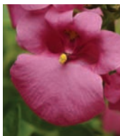
Diamonte™ Lavender Pink