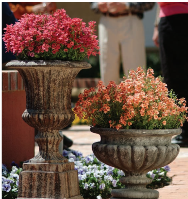
Diamonte™ Coral Rose and Diamonte™ Apricot