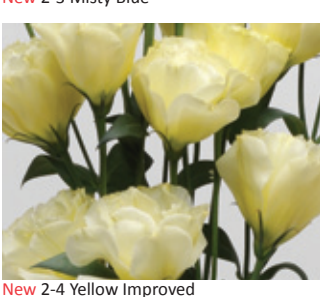
ABC Lisianthus Seasonality Number Guide

The first number, "Speed Guide," tells whether the variety is faster or slower to flower. The second number, "Versatility Guide," indicates whether the variety can be grown over a longer or shorter flowering period.