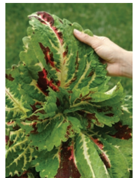
Kong® Mosaic Coleus