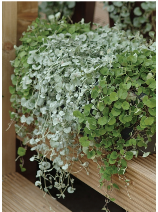
Emerald Falls Dichondra and Silver Falls Dichondra