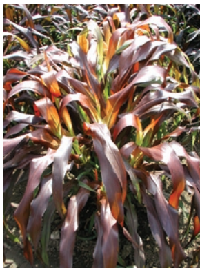
Jester F1 Ornamental Millet