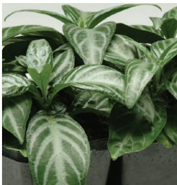
Maracas Brazilian Fireworks