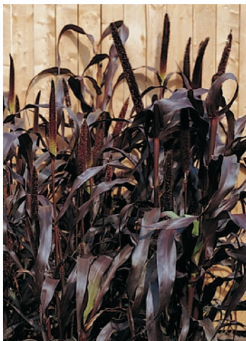
Purple Majesty F1 Ornamental Millet