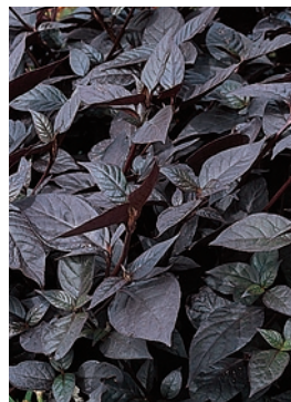
Purple Knight Alternanthera