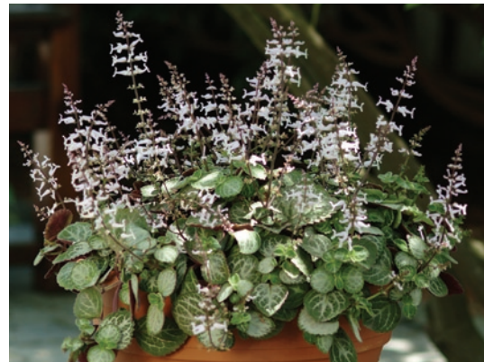
NEW Emerald Lace Plectranthus