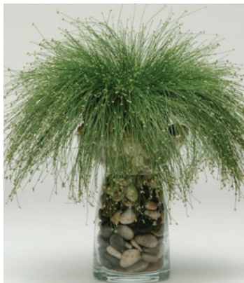
Live Wire Isolepis