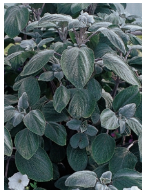
Silver Shield Plectranthus