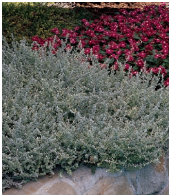
Silver Mist Helichrysum

Try the full lineup of Fantastic Foliage varieties today! Talk to your sales rep for ordering information.