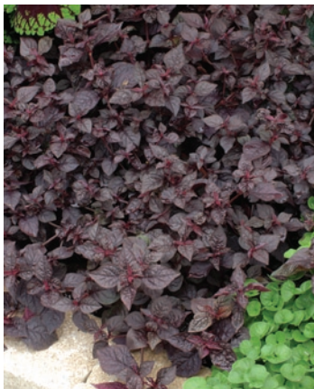
Purple Lady Iresine