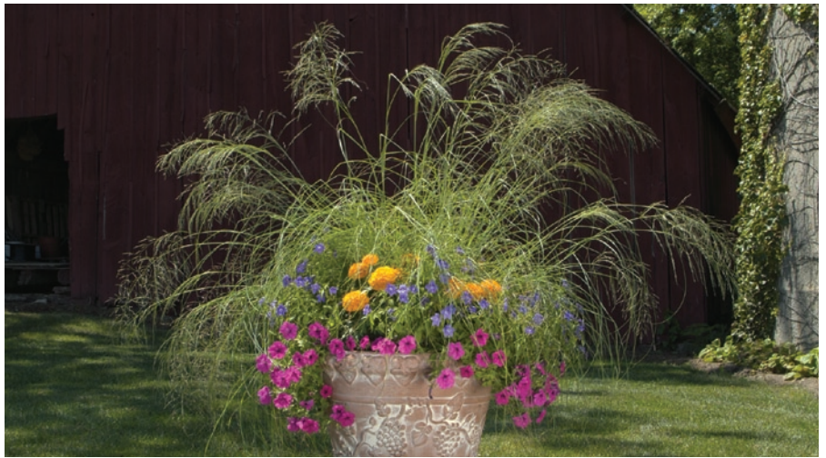
Wind Dancer Eragrostis