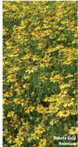
Dakota Gold Helenium