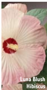
Luna Blush Hibiscus