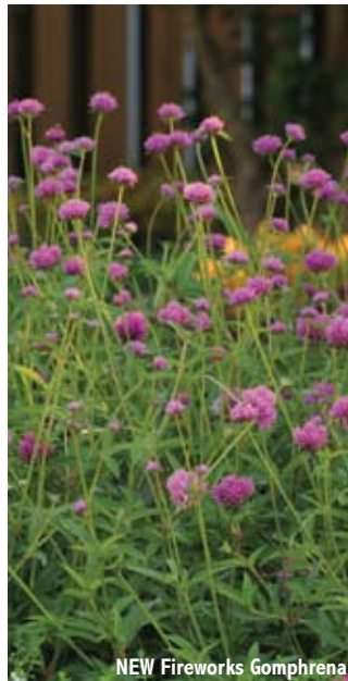
NEW Fireworks Gomphrena