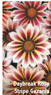
Daybreak Rose Stripe Gazania