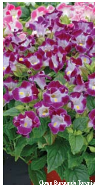
Clown Burgundy Torenia