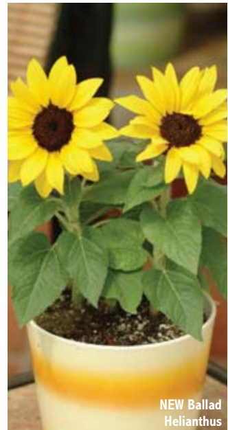
NEW Ballad Helianthus