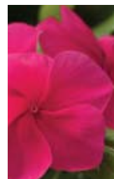
Mediterranean Dark Red XP Vinca