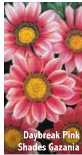
Daybreak Pink Shades Gazania