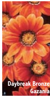
Daybreak Bronze Gazania