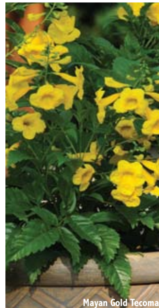
Mayan Gold Tecoma