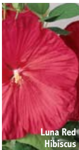
Luna Red Hibiscus