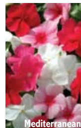
Mediterranean Lipstick Mixture XP Vinca