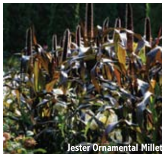
Jester Ornamental Millet