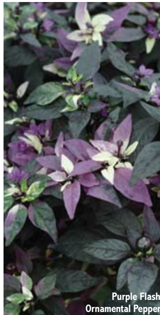
Purple Flash Ornamental Pepper