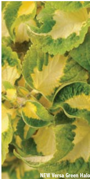
NEW Versa Green Halo