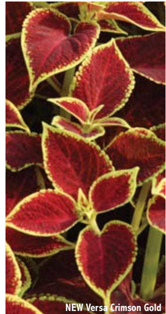
NEW Versa Crimson Gold