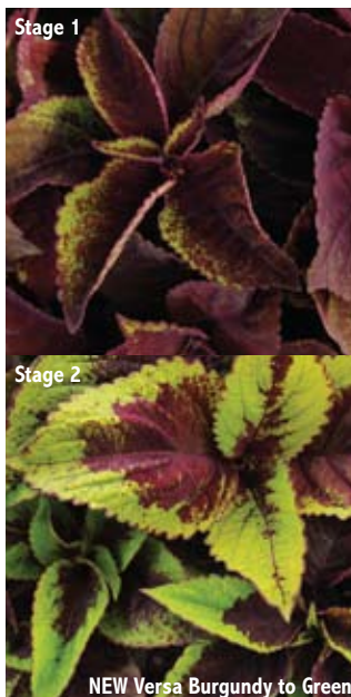
NEW Versa Burgundy to Green