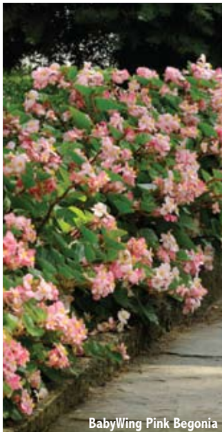
BabyWing Pink Begonia