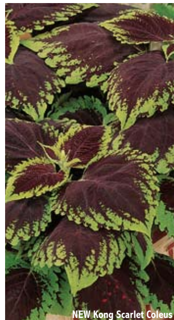
NEW Kong Scarlet Coleus