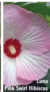
Luna Pink Swirl Hibiscus