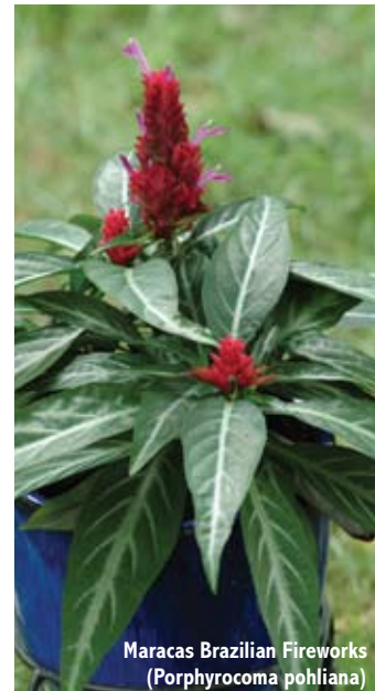
Maracas Brazilian Fireworks (Porphyrocoma pohliana)