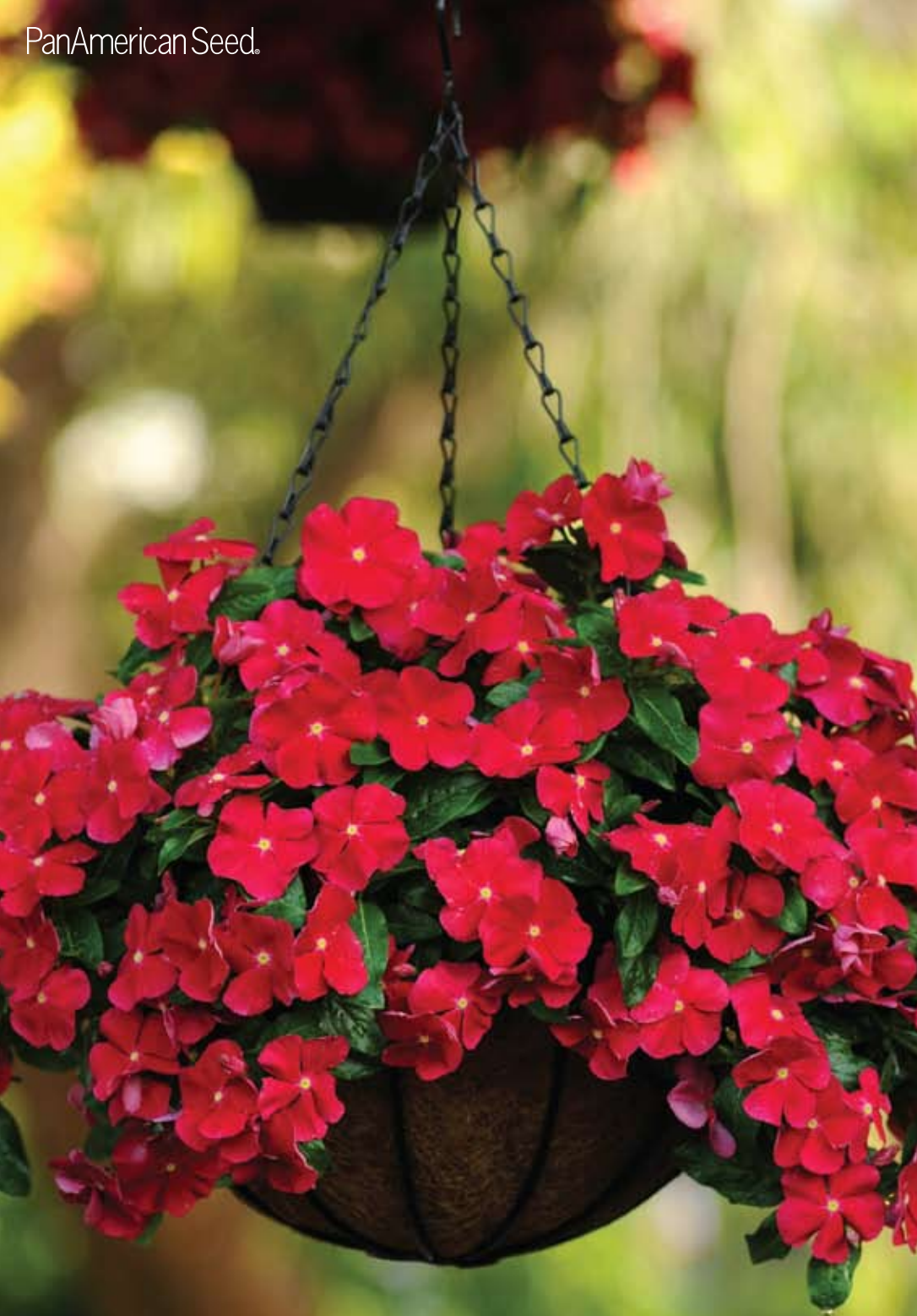
Mediterranean Red XP Vinca