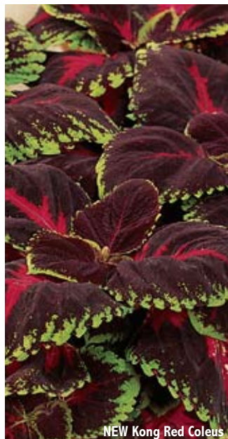
NEW Kong Red Coleus