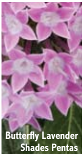
Butterfly Lavender Shades Pentas