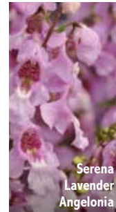
Serena Lavender Angelonia