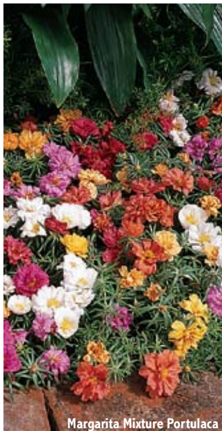
Margarita Mixture Portulaca