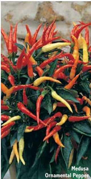
Medusa Ornamental Pepper