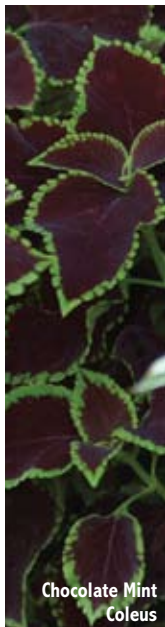
Chocolate Mint Coleus