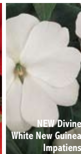
NEW Divine White New Guinea Impatiens