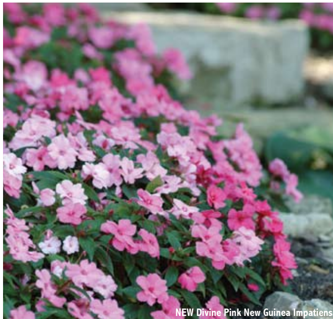
NEW Divine Pink New Guinea Impatiens