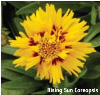
Rising Sun Coreopsis