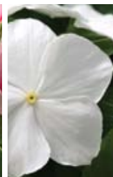
Mediterranean White XP Vinca