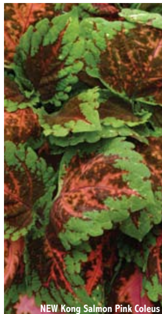
NEW Kong Salmon Pink Coleus