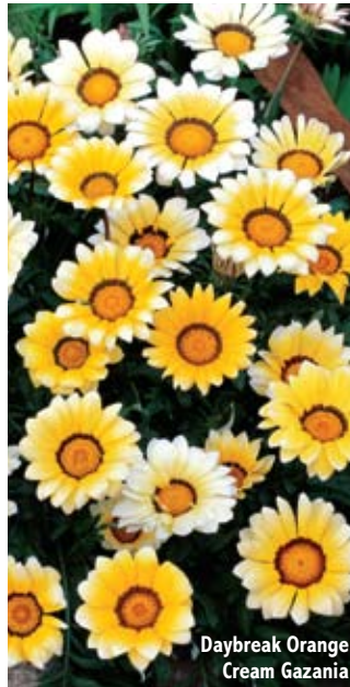
Daybreak Orange Cream Gazania