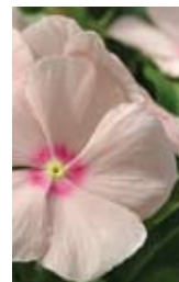
Mediterranean Peach XP Vinca