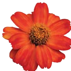
New Zahara Fire