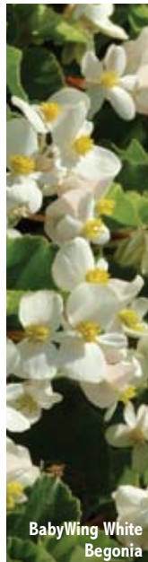
BabyWing White Begonia