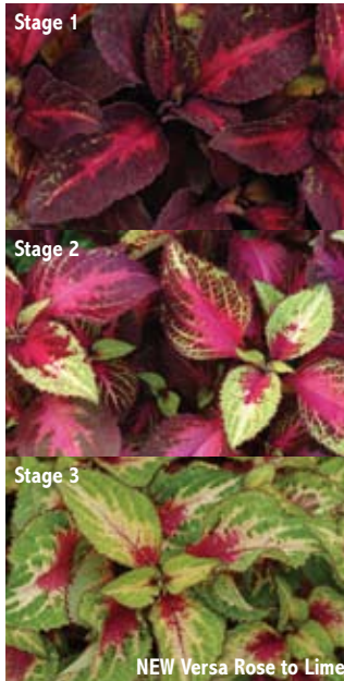
NEW Versa Rose to Lime