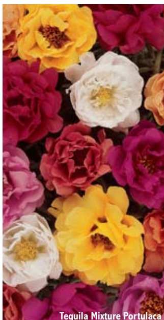
Tequila Mixture Portulaca