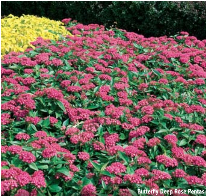
Butterfly Deep Rose Pentas