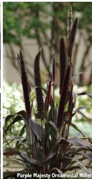
Purple Majesty Ornamental Millet