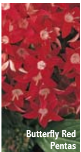
Butterfly Red Pentas