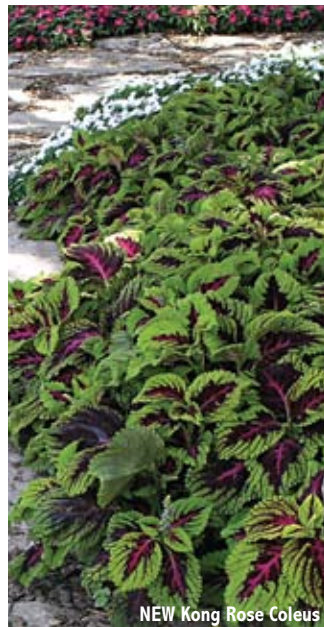
NEW Kong Rose Coleus