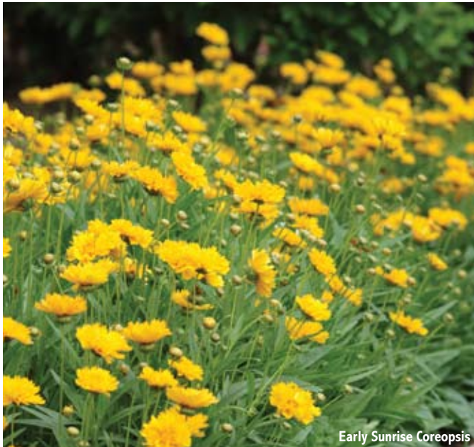
Early Sunrise Coreopsis