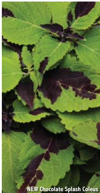
NEW Chocolate Splash Coleus