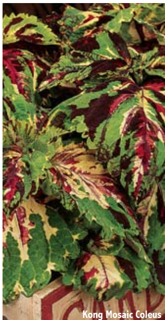
Kong Mosaic Coleus