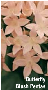
Butterfly Blush Pentas