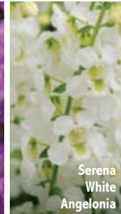
Serena White Angelonia