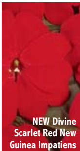
NEW Divine Scarlet Red New Guinea Impatiens