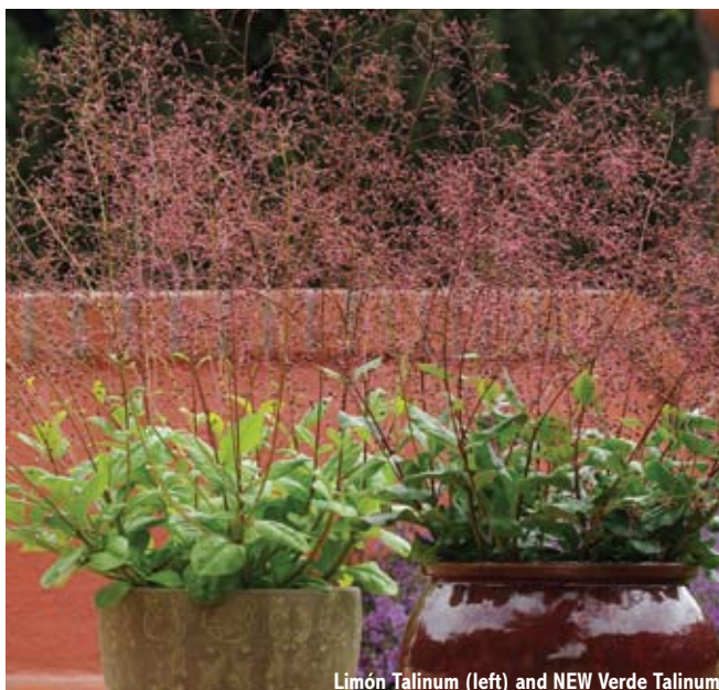
Limón Talinum (left) and NEW Verde Talinum