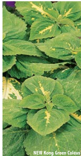
NEW Kong Green Coleus