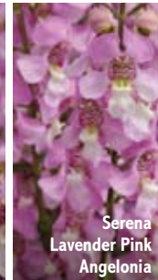
Serena Lavender Pink Angelonia