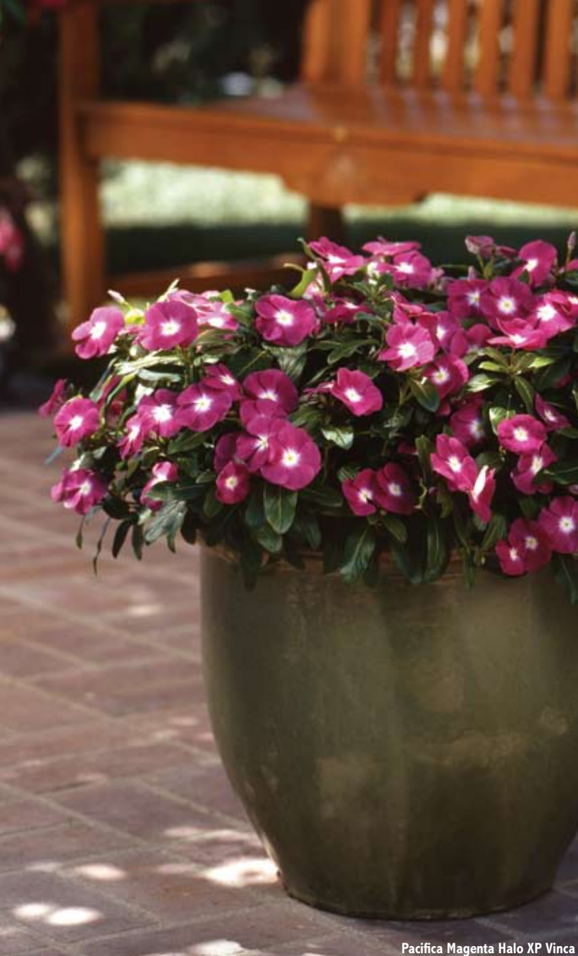
Pacifica Magenta Halo XP Vinca