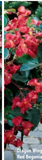
Dragon Wing Red Begonia