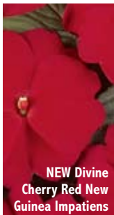
NEW Divine Cherry Red New Guinea Impatiens