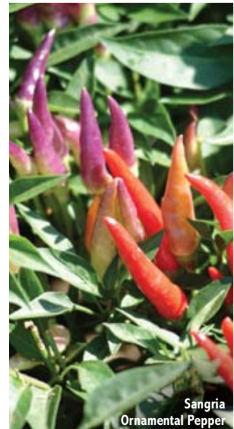
Sangria Ornamental Pepper