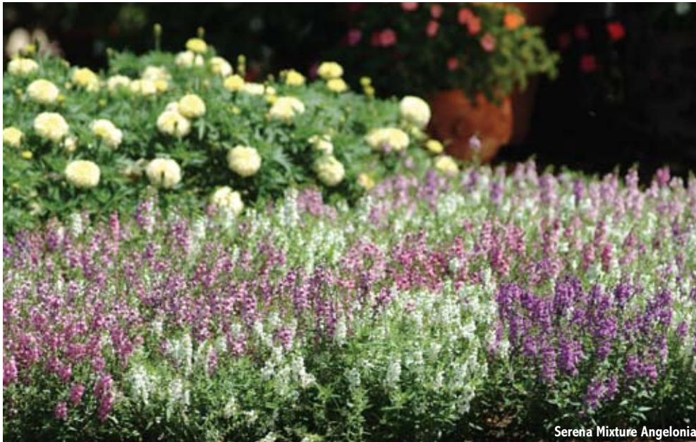
Serena Mixture Angelonia