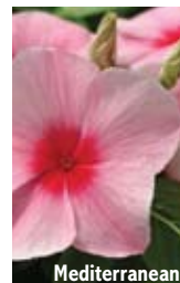
Mediterranean Strawberry XP Vinca