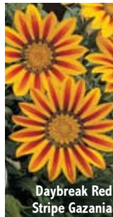
Daybreak Red Stripe Gazania