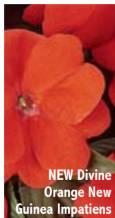
NEW Divine Orange New Guinea Impatiens