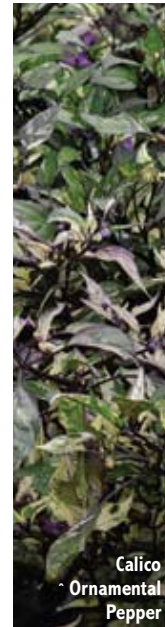
Calico Ornamental Pepper