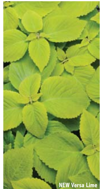
NEW Versa Lime