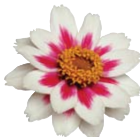
New Zahara Starlight Rose