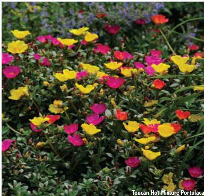
Toucan Hot Mixture Portulaca