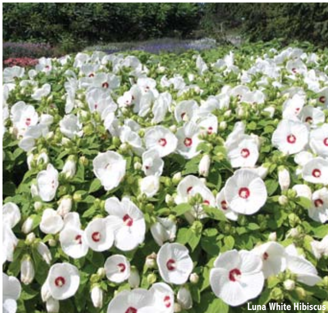
Luna White Hibiscus