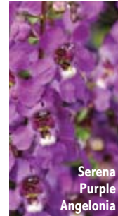
Serena Purple Angelonia