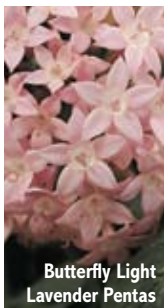
Butterfly Light Lavender Pentas