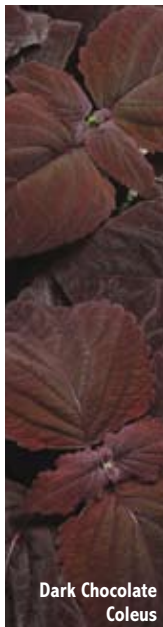
Dark Chocolate Coleus