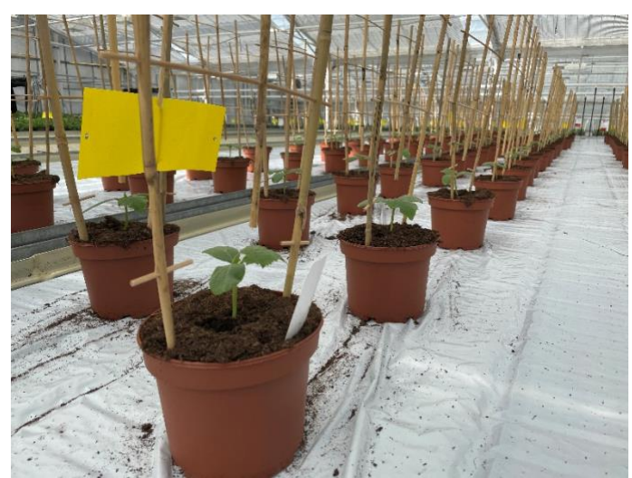
If possible, trellis and spacing is added within 2 weeks after potting