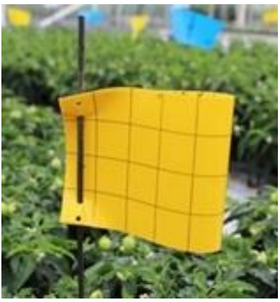
Sticky trap for monitoring